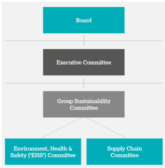
Sustainability governance structure.

The Sustainability Committee is supported by a supply chain subcommittee, comprising the procurement leads in all business areas, which is responsible for developing processes and procedures to assess opportunities and mitigate risks within our global supply chains, ensuring regulatory compliance as a minimum. The subcommittee focuses on providing transparency on social risks in our global supply chain and coordinating and overseeing actions to mitigate those risks.